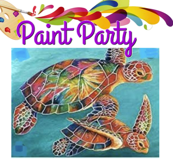
FRIDAY, August 26<sup>th</sup> at 7 PM - $30 per person Location: 26540 Vista Rd. Register at <u>www.helendalecsd.org</u>