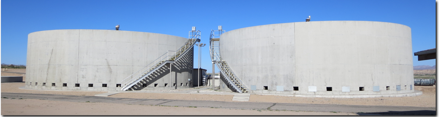
Above: Trickling Filters process wastewater utilizing a media with a biological mass. Below: View of primary clarifiers and trickling filter.

A Capital Improvement Plan (CIP) is developed with a five-year projection estimating future infrastructure needs. This short-range planning tool is critical for forecasting major repairs and replacement of existing infrastructure. Capital improvement projects include maintenance and enhancements to the treatment plant and collection system throughout the community. Meeting regulatory mandates and maintenance schedules plays a significant role in the District's requirement to invest in expensive and labor-intensive improvement projects. Many projects are driven by regulatory compliance.