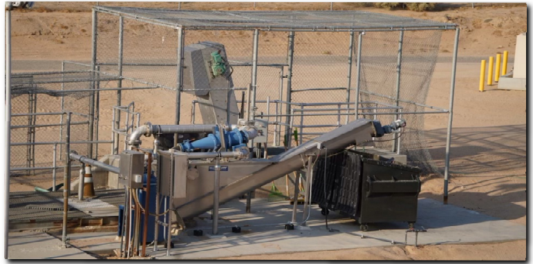
Wastewater Treatment Plant Headworks where raw sewage comes into the plant and bar screens remove large particles from the waste stream

Helendale CSD's proposed wastewater rate increase is consistent with a rate study performed by Bartle Wells Associates, an independent professional consulting firm. The rate structure that is being proposed reflects their professional opinion incorporating cost of service with adequate debt coverage and sufficient operating revenue. The study took into account (1) charges for service; (2) infrastructure replacement and capital improvement projects for system upgrades discussed in this Notice, and (3) inflationary pressure on routine operating costs. Based upon the factors, elements, and calculations considered in that study, a rate increase in the amount set forth herein was recommended. Copies of the rate study may be viewed on the District's website at www.helendalecsd.org , or at the District office located at 26540 Vista Road, Suite B. As a public agency, the Helendale Community Services District receives no profit from its wastewater rates and is obligated to charge customers no more than the actual costs incurred for the services that HCS D provides. Standard expenses include operations and maintenance, government compliance costs, and the development of capital improvement projects. HCS D collects no tax money for wastewater, and customers pay only for the services they receive.