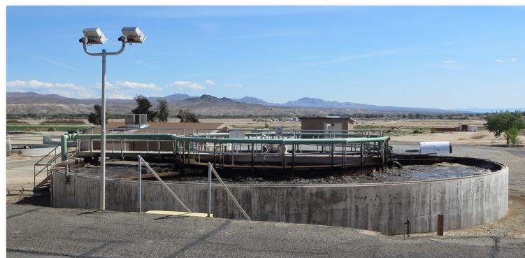
The digester is a critical part of the plant treatment process.

The proposed rate increase outlined in this notice is designed to collect sufficient revenues required to fund critical capital improvement projects, cover debt service obligations and meet increased operating expenses. The District's basic operational costs have seen increases including rising electricity costs to operate the wastewater plant and collection system 24 hours a day; maintenance and infrastructure costs; labor-related costs and increased expenditures for capital projects due to regulatory mandates. Helendale Community Services District is committed to operating the infrastructure to meet all regulatory standards and ensure the integrity of the entire system.