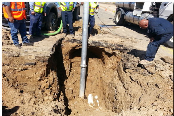
Force main break in 2016. This force main was replaced in 2019 at a cost of $329,760.

Despite our best efforts to keep costs down, the rapidly escalating costs of operating the sewer plant, collection system and completing capital projects have surpassed annual revenues.