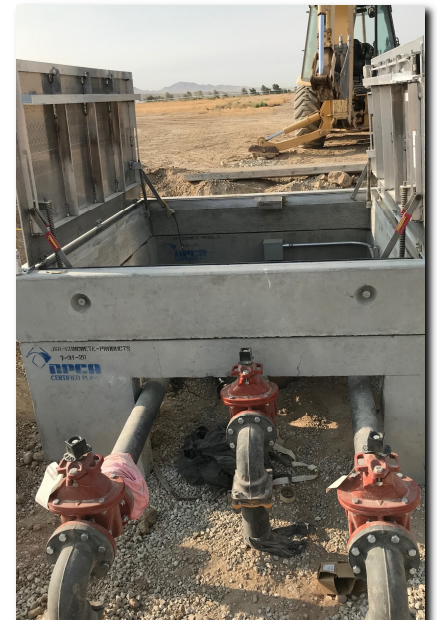
Secondary Irrigation manifold