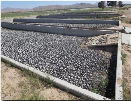
Sludge Drying Beds

The District's financial approach to capital improvements combines responsible fiscal decision making with a thoughtful approach to infrastructure planning. Capital projects are often complex and require considerable effort and financial resources to implement. Many of these large projects must be completed by contractors in compliance with the Public Contracts Code. Helendale CSD evaluated a broad range of potential projects to determine the top priorities that meet regulatory demands, support continued compliant treatment of the community's sewage, and maintenance of the sanitary sewer system. Over the next five years the District has outlined $3.8 million dollars in capital needs.