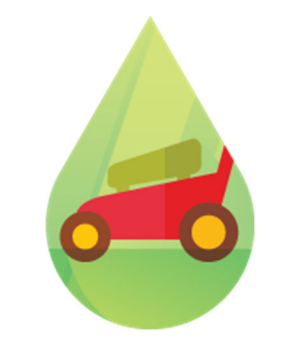
SET MOWERBLADES TO 3"