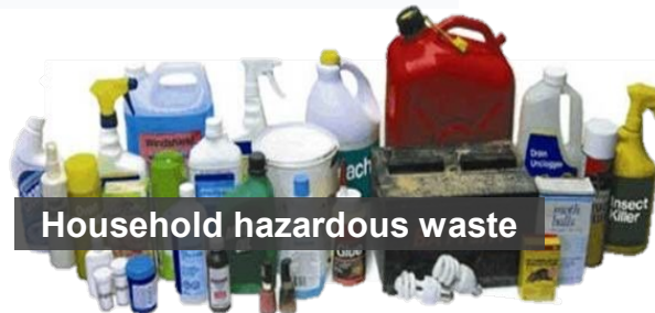
Household hazardous waste