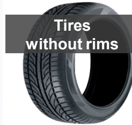
Tires without rims